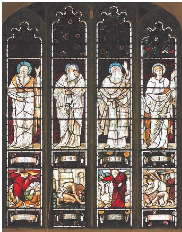
Stained glass in Jesus College chapel, Cambridge, designed by Edward Burne-Jones and made by William Morris. This depicts the Old Testament prophets Isaiah, Jeremiah, Ezekiel and Daniel.

That is what we find in the Latter Prophets also. Isaiah is sent to a people whose spiritual senses are dull (Isaiah 6:9-10). The book which bears his name was, in fact, written in Hebrew over several centuries, beginning in the mid-eighth century BCE. Its words were not just for Isaiah's own generation, but had to wait for future generations to bear fruit. The book begins by referring to a "vision" which Isaiah "saw," or, possibly, to "the vision of Isaiah, who prophesied" (the Hebrew is ambiguous). I tend to prefer the former—Isaiah saw a vision which came to him, that was not of his own making, the significance of which would take centuries to unfold.