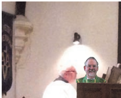
"I came to look forward to our Saturday morning meetings to go over the music for Sunday."

He was unsure of the place of concerts in the life of Saint