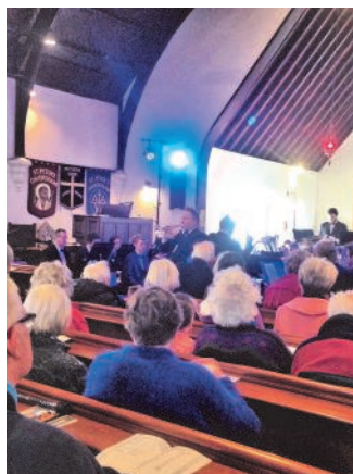
A 2019 concert in Saint Peter's.