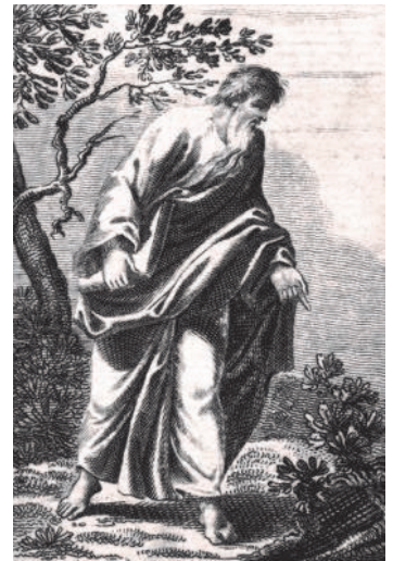
The Prophet Hosea.

The prophets remind us that there is a divine word and will which lies beyond our hearing and sight, but holds the whole of creation in its grasp. We see and hear hints of it in the scriptures and behold its fullness in Jesus. 📖