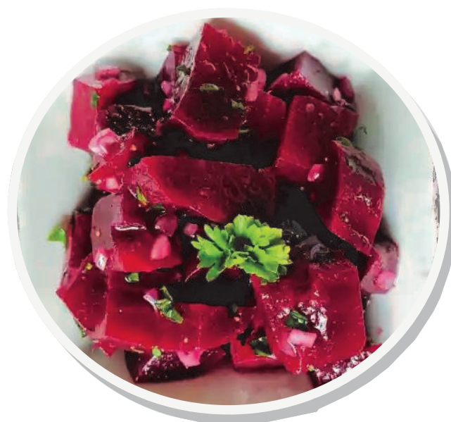
"Easy beet salad".

In general beets/beetroot are versatile foods, full of vitamins, minerals, antioxidants, fibre and other healthy plant compounds. However, as is sometimes the case, there are one or two groups, for example people at a higher risk for calcium oxalate kidney stones, who may be advised by their doctor to limit their beet intake. 📺